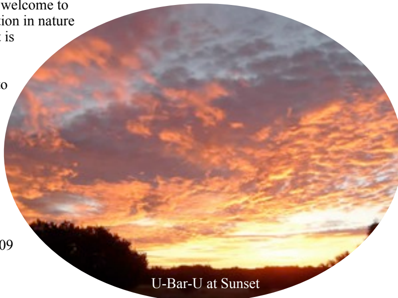
U-Bar-U at Sunset