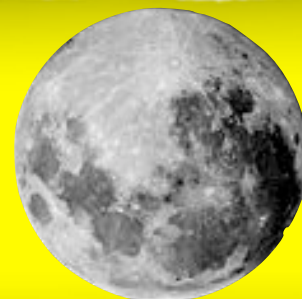
"Super harvest moon" over Austin Sept. 22, 2010