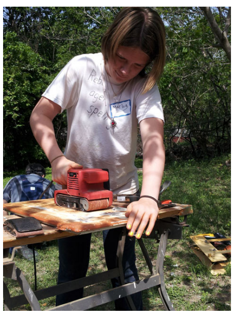
Hands on Housing volunteer busy sanding