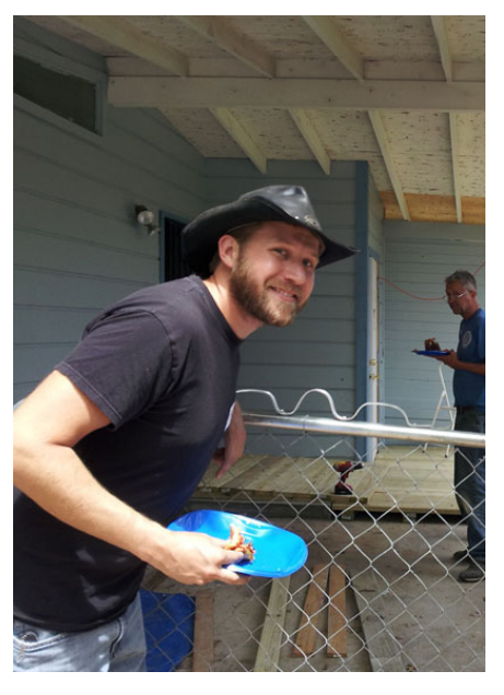
Getting ready for next project