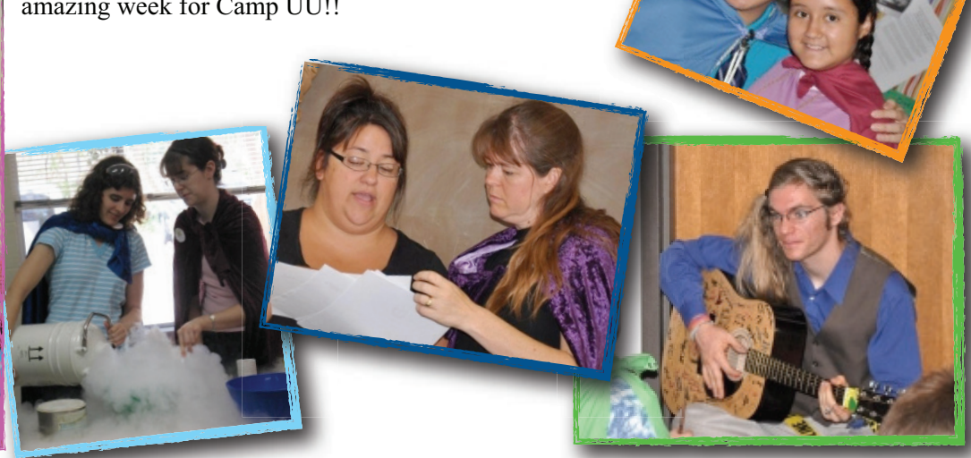
Page 9 of 12